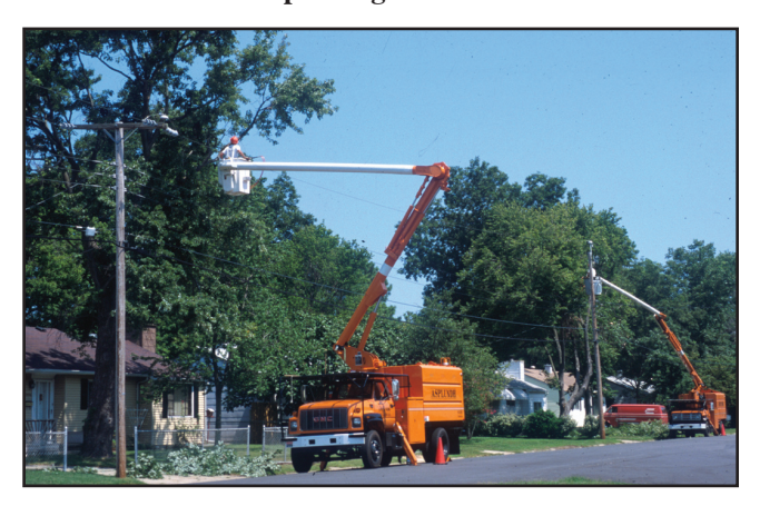
Trained arborists removing limbs in utility easements.

Additional options for dealing with utility line/street tree conflicts include the use of tree growth regulators, tree height control by pollarding (yearly pruning back to one trunk or branch area), and initiation of tree pruning far in advance of tree-line interception. Each of these options tries to prevent future conflict situations, but is still costly maintenance. Whole tree removal eliminates the conflict but negatively impacts the environment and community.