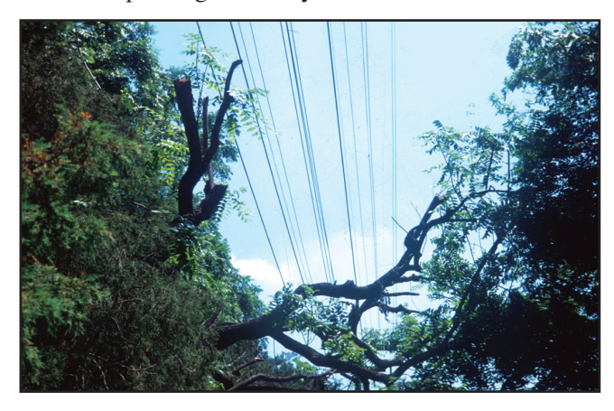
Directional pruning for line clearance.

Line clearance methods for existing utility line/street tree conflicts, such as natural, lateral, and directional pruning, have been developed to minimize the impact of pruning on tree health. Unfortunately, people often find this necessary pruning to be aesthetically unacceptable. Because of the inherent danger of electric lines, any pruning needed within easement areas should only be carried out by arborists trained in line clearance pruning, never by homeowners.