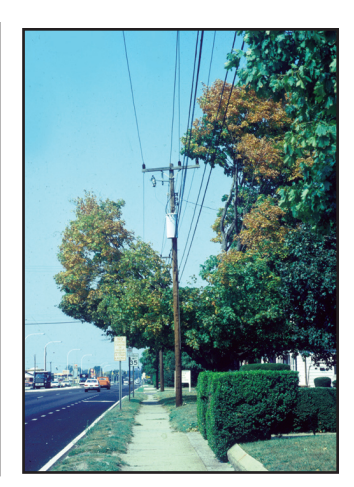
Misshapen tree canopies due to necessary line clearance pruning.