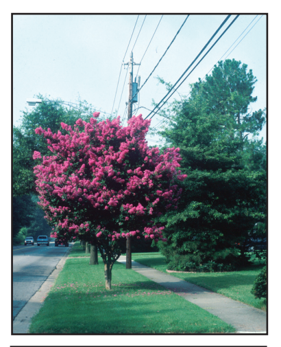
Crape myrtle, a large shrub or small tree that can be used under overhead lines.

Selection of appropriately sized trees prior to planting is critical to the trees' successful co-existence with overhead utility lines. This option is available to anyone involved with landscape design and installation - city planners, landscape architects, designers and contractors, arborists, and private homeowners. Proper selection and planting of trees near overhead utility lines can improve the appearance of the landscape, prevent safety hazards, improve electric service reliability, and reduce line clearance expenses for utility companies and their customers.