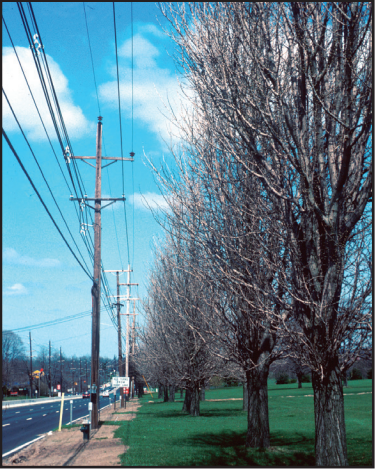
Tall, upright trees can be planted along, but never under, overhead lines.