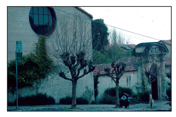
Large sycamore trees pollarded to keep them from infringing on utility lines.

The best approach is to prevent street tree/utility line conflicts from arising in the first place. Where practical, new utility lines can be constructed to avoid potential conflicts with trees either by installing lines underground or routing lines to avoid existing trees.